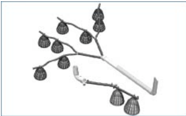
Nylex irrigation domes www.nylex.com.au